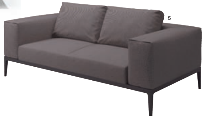
1. Shayna Blaze for Urban Road Fleeting Moments artwork in Smudge, from $120, Urban Road. 2. Husk pendant light, $169, Beacon Lighting. 3. Gus Halifax chair, $1595, Globe West. 4. Basic rectangular 100 per cent marble tray, $135, Marble Basics. 5. Gloster Grid sofa, POA, Cosh Living, www.coshliving.com.au . 6. Tribù Illum collection lounge, POA, Cosh Living, www.coshliving.com.au . 7. Abby floor lamp, $269.95, Amalfi. 8. Paramount sculpture, $12.95, Emporium.